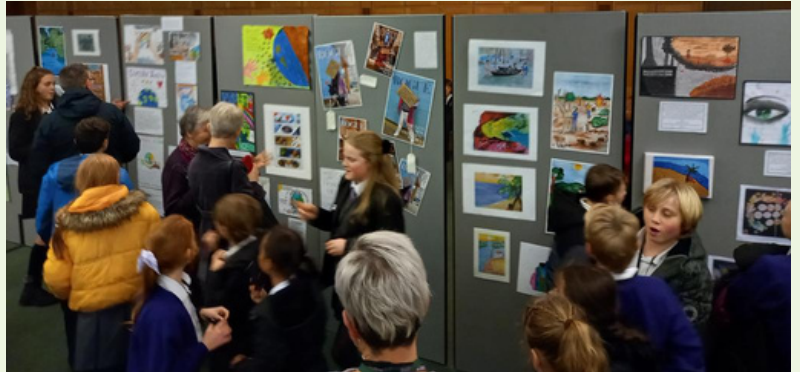
The Creative for the Climate exhibition in the Houses of Parliament

Get Creative For Climate Justice is a partnership organised by CAFOD, Christian Aid, Oxfam, the Royal Society of Literature and Send My Friend to School with support from the Climate Coalition.