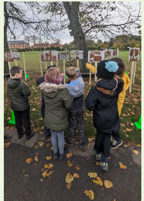
Outdoor community climate justice exhibition

Your project contact can help with advice about contacting your MP, MSP, MS or MLA. There is a step-by-step Oxfam schools guide about organising an elected representative meeting here and writing a press release here .