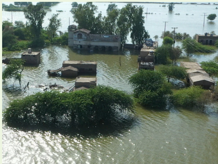
Flooding in Balochistan province, Pakistan, in September 2022. Between 10%-12% of the entire country was flooded. This is one of the costliest weather disasters in human history. Its causes are linked to man-made climate change.

In addition, each of the partner organisations has additional climate justice school resources. There is a directory of these resources at the end of this guide. Please use these resources as you wish.